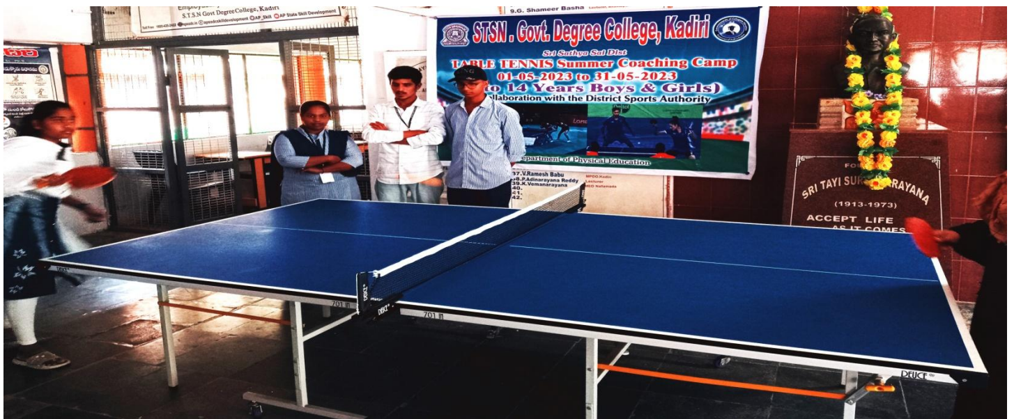
Game Practice & Skills practice