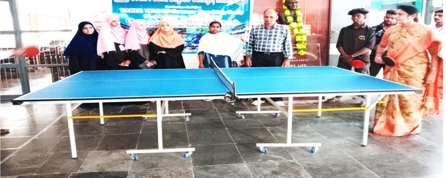
Our principal Madam practice along with the students